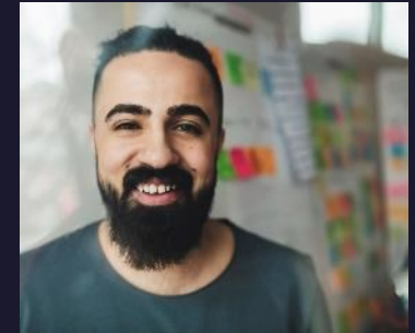
Education & Awareness