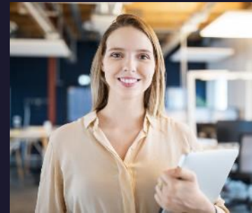
Youth & Prevention